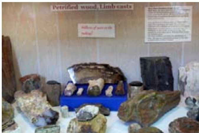
Al Hess - Petrified Wood